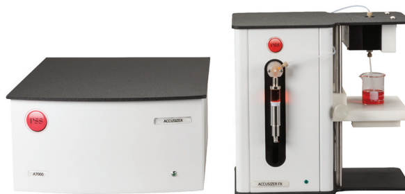
Figure 1. AccuSizer SIS system

The AccuSizer A2000 SIS (Figure 1) is specifically designed for customers performing USP <788> particle testing.