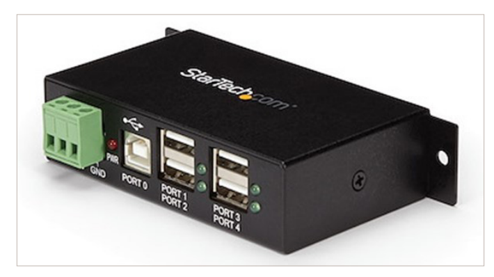
Figure 1. USB 2.0 Hub.

The newer counter box introduced into the Entegris AccuSizer product line is referred to as the multi-channel pulse analyzer, or MCPA counter. This replaced older counter boxes we now refer to as legacy counters. Your MCPA particle counter may include the USB hub shown in Figure 1. This technical note provides guidance on why and how to install the USB hub.