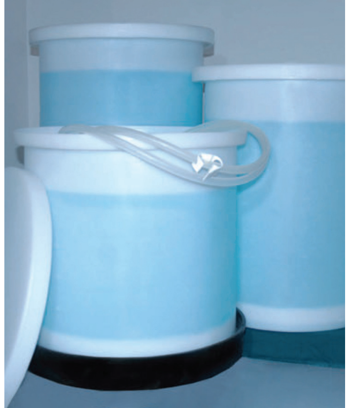
Custom sizes, configurations, and materials available to meet your needs