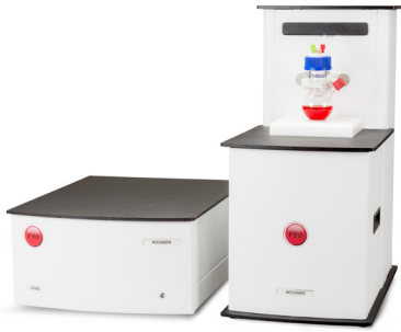
Figure 2. AccuSizer AD

This process creates microbubbles similar to the FDA approved Definity perflutren lipid microsphere injectable suspension marketed by Lantheus Medical Imaging, but with a different lipid formulation.