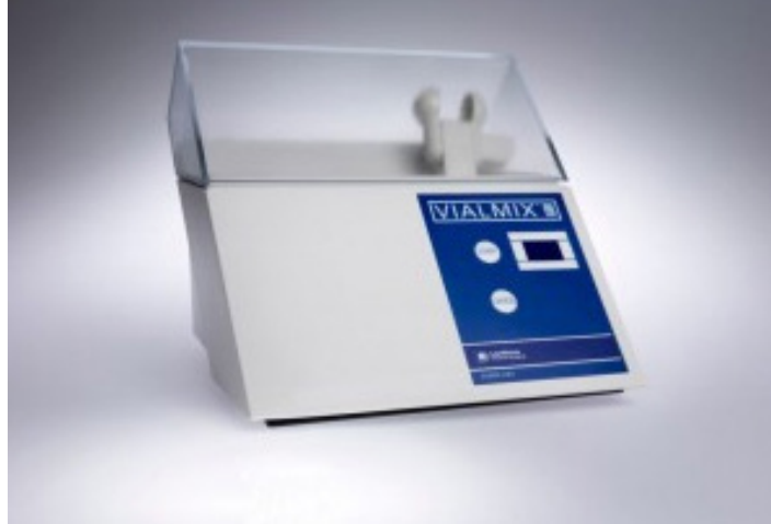
Figure 1. Lantheus Vialmix

CRPPR is a Neuropilin-1 (NRP1) targeting peptide. NRP1 is a receptor for vascular endothelial growth factor and its expression is up-regulated in multiple tumor types, as well as on tumor vasculature. Microbubbles prepared at the Ferrara Lab were used