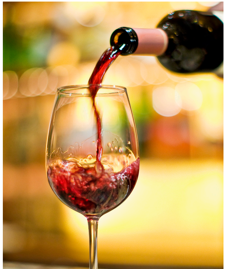
Contaminants in the production process can significantly impact wine quality.