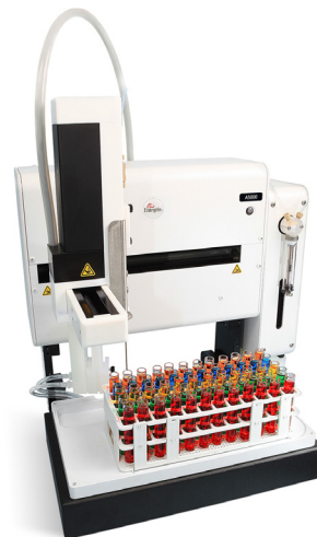
Figure 4. AccuSizer Autosampler

USP <788> testing can be fully automated using the AccuSizer Autosampler, Figure 4. Load the samples into the tray, program the system with the desired protocols and let the system process the entire tray automatically.