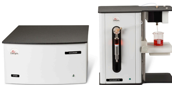
Figure 1. AccuSizer SIS system

The AccuSizer A2000 SIS (Figure 1) is specifically designed for customers performing USP <788> particle testing.