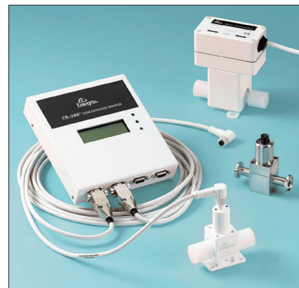
Figure 1. Entegris IoR Concentration Monitors

The process of removing cells and cellular debris from a harvested culture prior to purification is typically performed using depth filtration, tangential flow filtration, centrifugation, or a combination of methods. Filters are often placed downstream in order to capture any material that escapes the separation method. PAT methods are