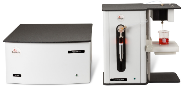
AccuSizer 7000 SIS system

The AccuSizer software is a sophisticated package that automates USP <788> testing including pass/fail criteria and acceptance approval.