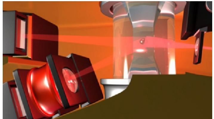
LE400 sensor principle