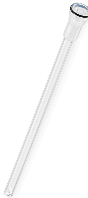
NDT-TX-X FEP diptube shown with EPDM O-ring

*ISO standard certification is kept up to date as necessary to remain current and effective to be able to demonstrate compliance with up-to-date ISO requirements.