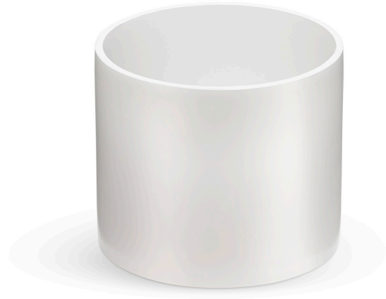
NA-110-50 shipping ring

The NA-110-50 shipping ring is placed over the NCD-AA-AA dispense closure after it is sealed onto filled NOWPak ® bottles. The shipping ring is required for chemical transportation to comply with Department of Transportation (DOT) and United Nations (UN) specifications when shipping filled NOWPak bottles.