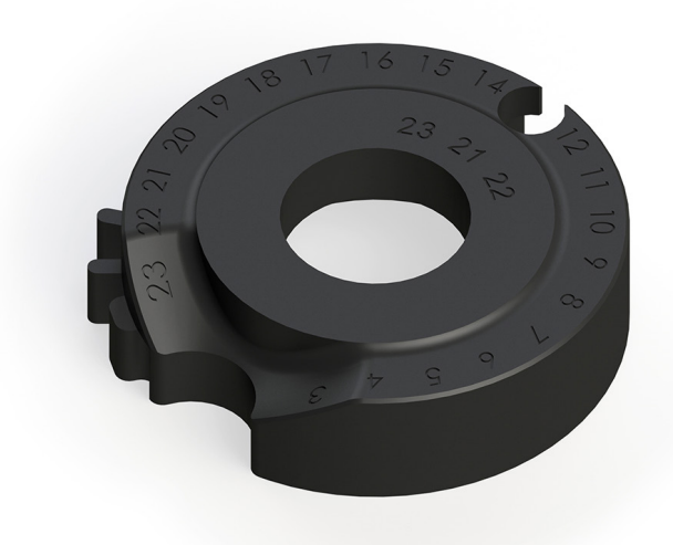
ErgoNOW keyed retainer

The keyed retainer component of the ErgoNOW<sup>™</sup> connector helps ensure that the correct material is dispensed when using the ErgoNOW connector in conjunction with the SmartCap<sup>™</sup> closure. The connector snaps into place only when the connector and closure key codes match. The replacement retainer kit allows customers the flexibility to update their connector with a new chemical key code.