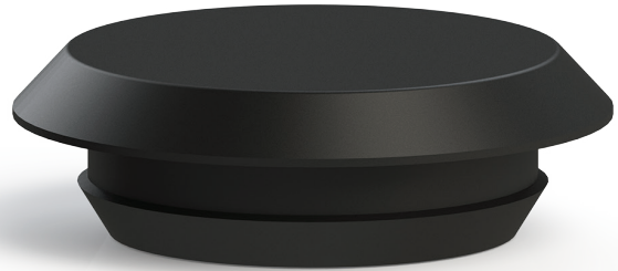
NA-65-100 SmartCap closure plug